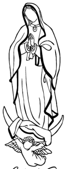
Our Lady of Guadalupe since 1967